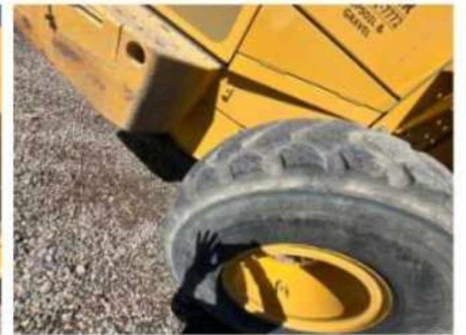
Left Track - Photos