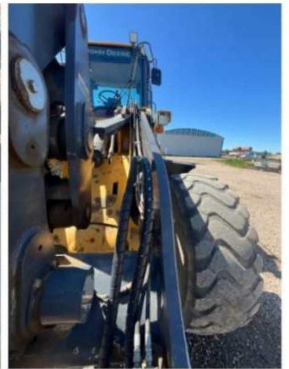
Hydraulic System Photos