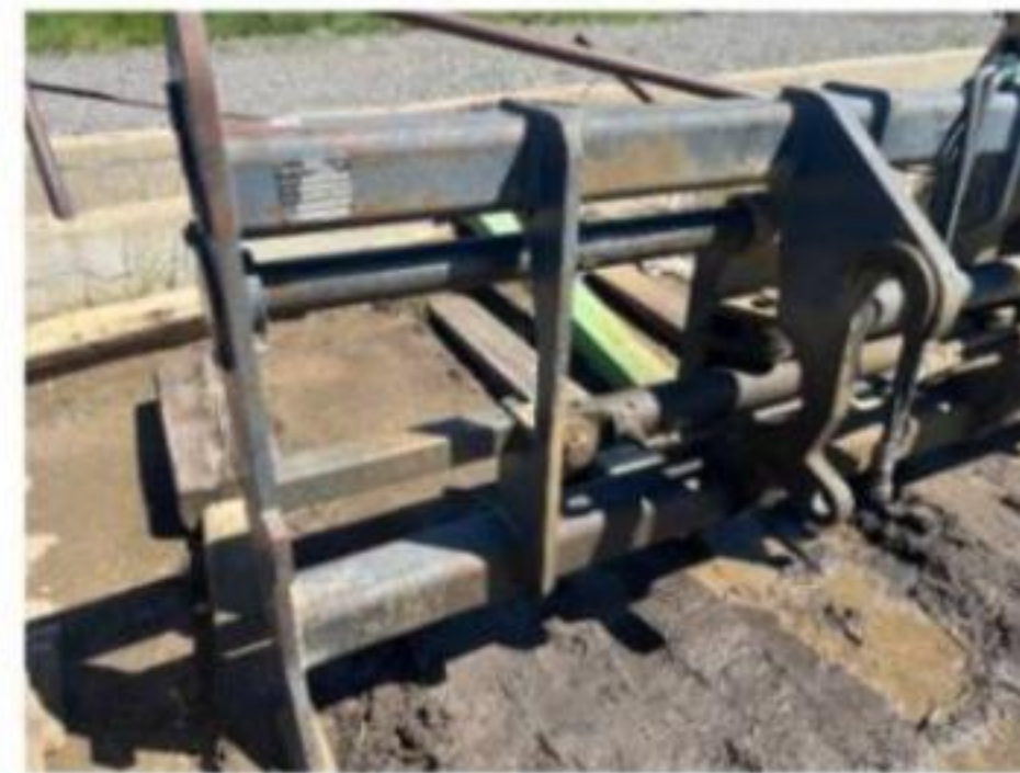
Attachment Width Photo