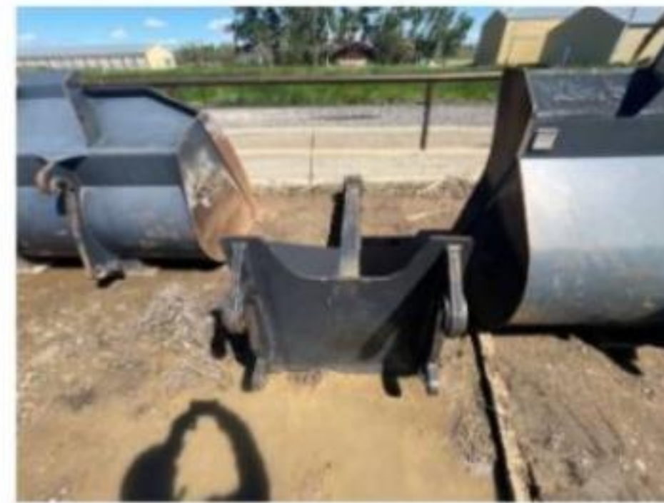
Attachment Serial Number Photo