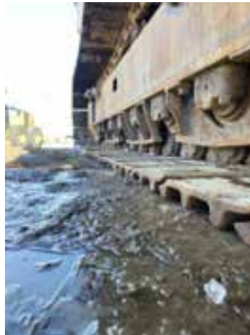
Right Track - Photos