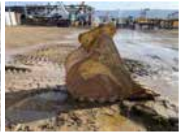
Attachment Serial Number Photo