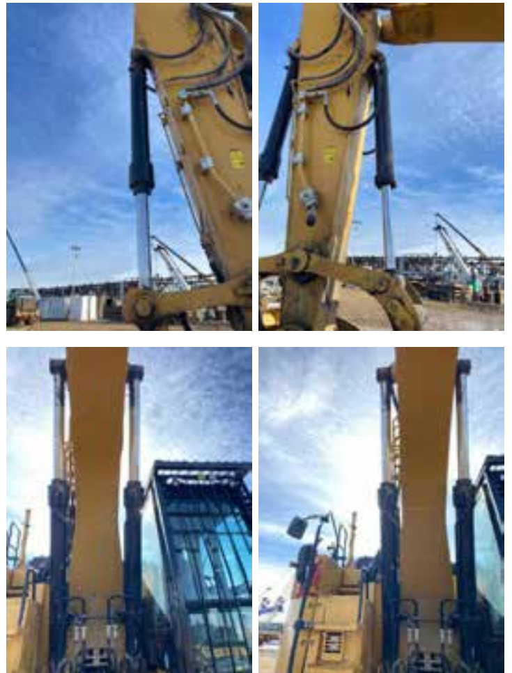
Hydraulic System Photos