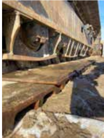
Pad Width Photo