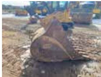
Attachment Serial Number Photo