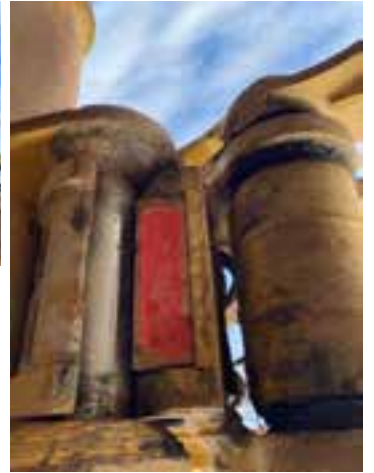
Hard Bar Photos