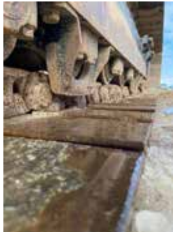
Pad Width Photo