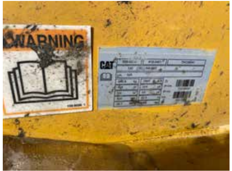
Attachment Width Photo