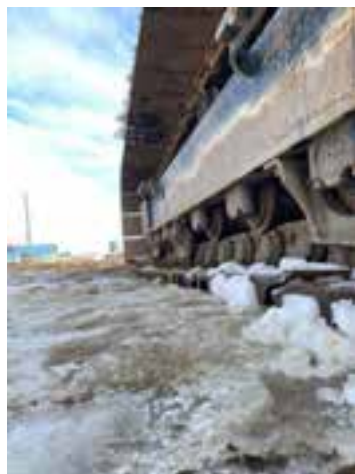
Right Track - Photos